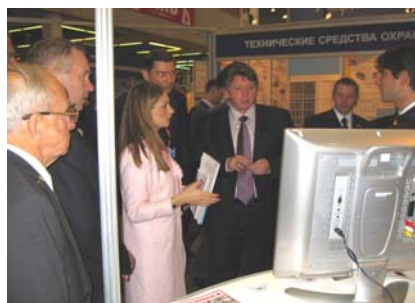
Russian Deputy Minister of Interior, Mr. Suhodolsky, visits U.S. Country Pavilion organized by Equity Intl. in Moscow in October, 2005

Equity International is pleased to invite you to participate in the Mission to Russia, part of The U.S. Homeland Security Trade Mission to Ukraine and Russia , the 3rd homeland security delegation to Eastern Europe organized Equity International.