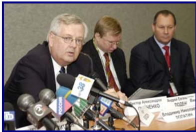
U.S. Congressman Curt Weldon speaks at Equity's Trade Mission to Russia in February

Equity International organized the 1 st Homeland Security delegation to Russia on February 1-4, 2005, marking the first historical involvement between American and Russian industry and governments in the global fight against terrorism.