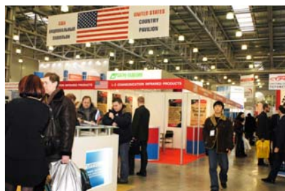
February 2005 - The 1 st U.S. Country Pavilion presenting US homeland security solutions