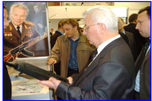
The first President of Ukraine, Mr. Leonid Kravchuk, visited “Arms & Security – 2005”